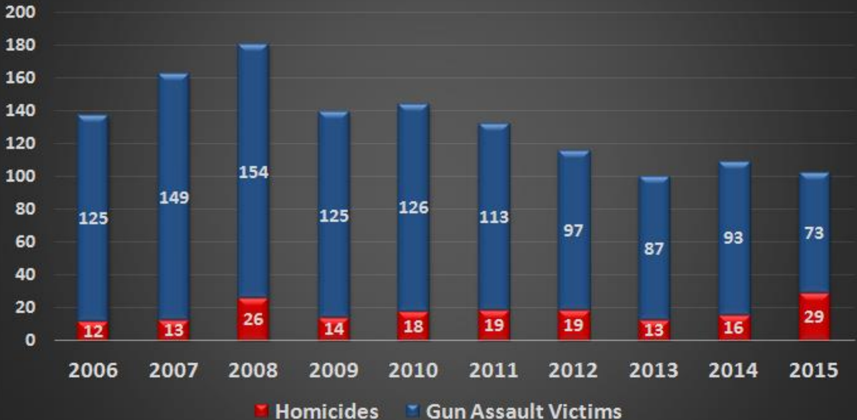
Gun Violence Trends: Northeast Precinct Source: OPD Preliminary 2006-2015

Omaha 360 An initiative of the Empowerment Network